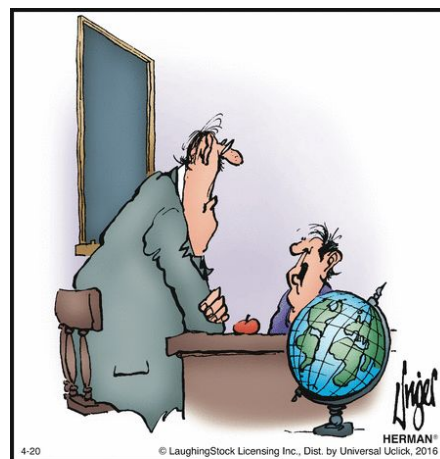
"The capital of Holland is 'H.'"